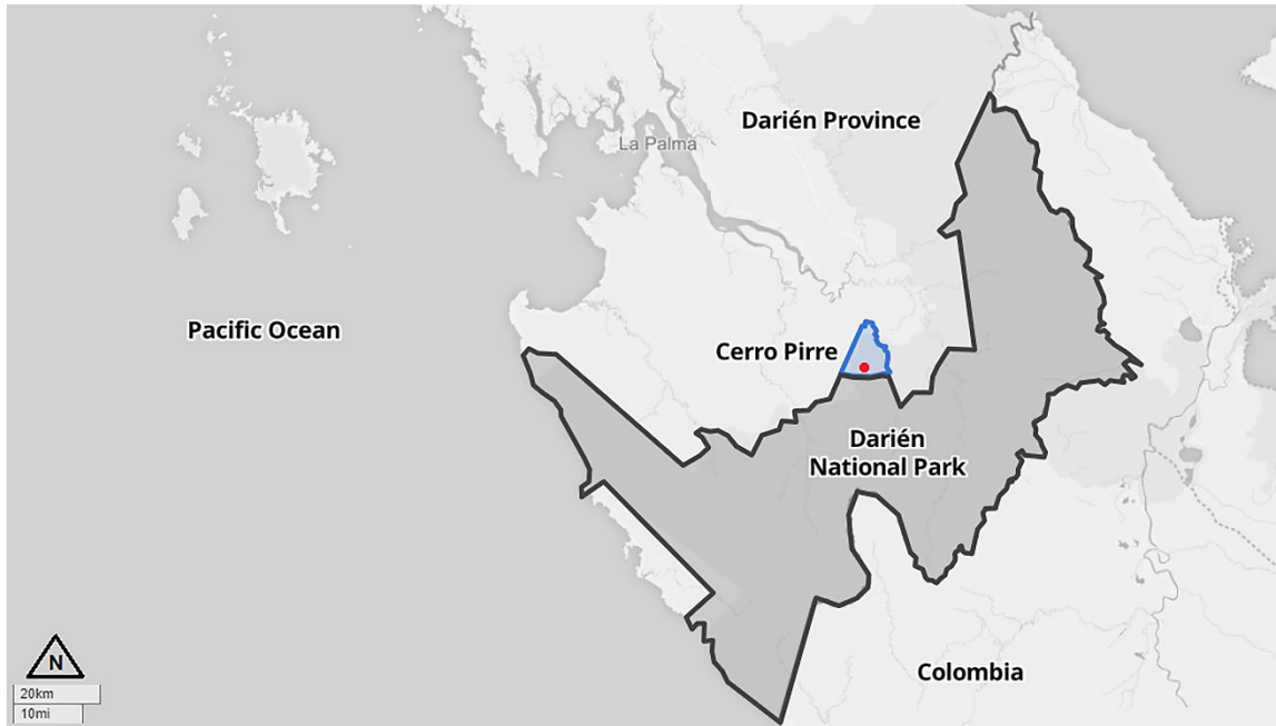
Figure 1. Location map of the study site (blue colored) and the Cerro Pirre summit (red dot) in Darién National Park (gray colored).

In order to complement the list of species for the floristic inventory, databases and collections deposited in PMA, MO and Smithsonian Tropical Research Institute (SCZ) herbaria were consulted. The abbreviations (Alpha-2 code) used for the countries are according to ISO 3166 (ISO, 2018). The geographical distribution of the species was obtained from Balick et al. (2000), Brako and Zarucchi (1993), Croat (1983, 1986, 1991, 1999, 2004), Croat and Acebey (2014), Croat and Carlsen (2013), Croat and Hannon (2015), Croat and Ortiz (2016), Croat and Stiebel (2001), Correa et al. (2004), Idárraga-Piedrahita et al. (2011), Funk et al. (2007), Dorr and Stergios (2014), Grayum (1996, 2003), Madison (1977), TROPICOS (2018), Nelson (2008) and Wong et al. (2016).