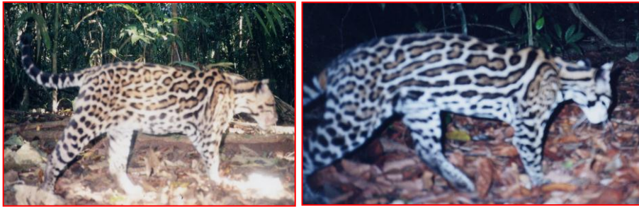
Left to right: V-19, G-22