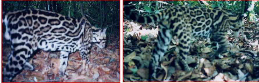
Left to right: R-34, I-23